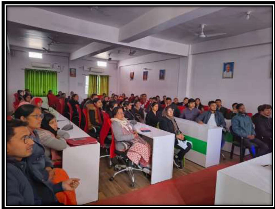
Students and Teachers Watching Motivational Movie through ICT

Principal Maulana Mazharul Haque Teachers Training College Mathurapur, Samastipur