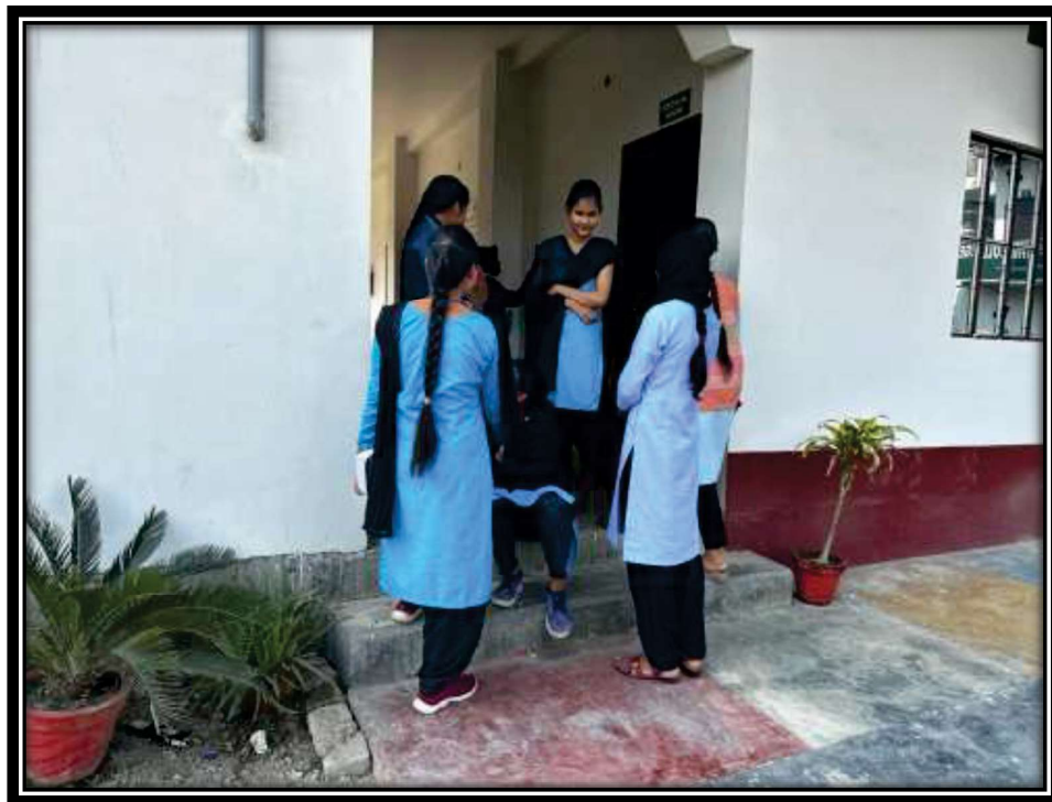
Students using ICT Out of the class

Principal's Principal Maulana Mazharul Haque Teachers Training College Mathurapur, Samastipur